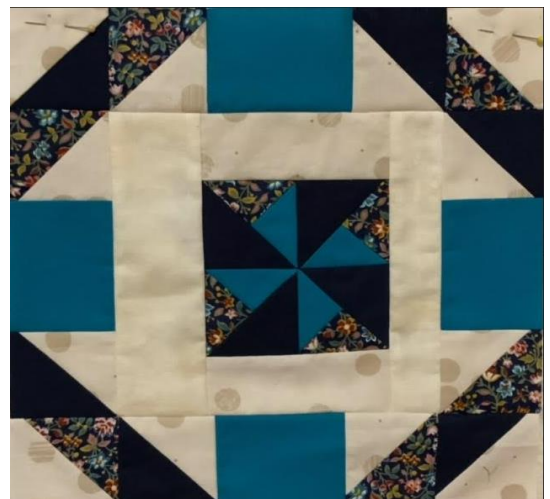
Optional Bonus Block