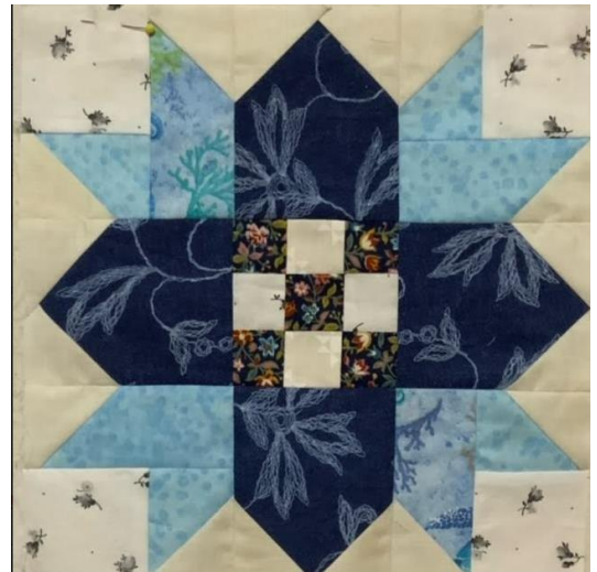
Checkerboard Star Block